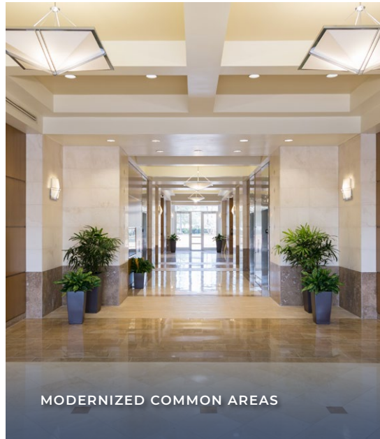
MODERNIZED COMMON AREAS