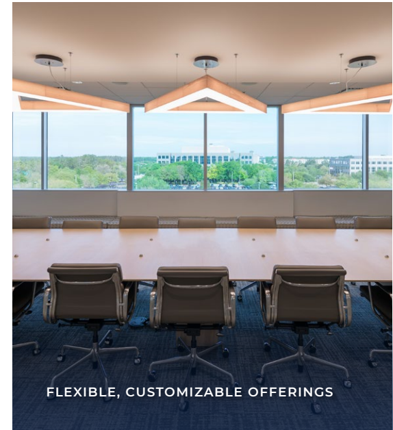
FLEXIBLE, CUSTOMIZABLE OFFERINGS