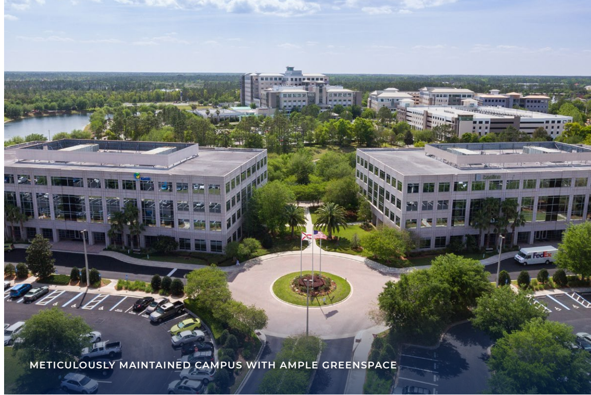
METICULOUSLY MAINTAINED CAMPUS WITH AMPLE GREENSPACE

Flagler Center is a seven-building, 760,000-square-foot office park located with immediate access to I-95, US-1 and 9B. Adjacent to the booming St. Johns County, the campus-style setting, generous green space and recently renovated common areas provide an exceptional workday experience. With flexible availabilities allowing the ability to seamlessly scale in place, explore what Flagler Center has to offer.